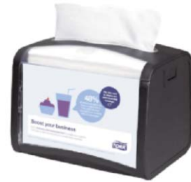
Black Tabletop 4 ct. 623200 52210