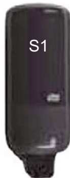
Tork Liquid Soap 52376 6 ct.