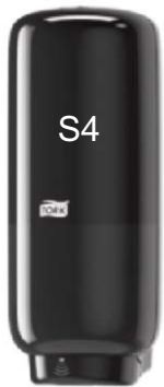
Touch-Free Foam 52378 4 ct.