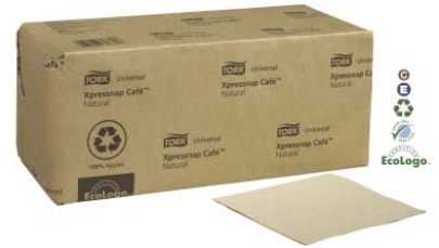
Natural Napkin 12/500 ct. DX606E 49556