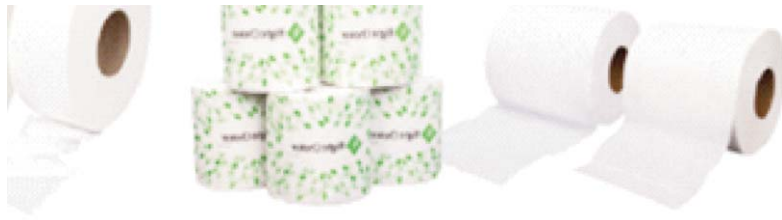
Universal Bath Tissue Jumbo 3.55" Roll 49730 12/1M 75004361