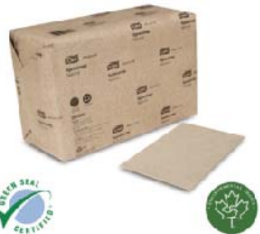
Universal Xpressnap Dispenser Napkin, Interfold - N4 Natural 1 ply 49554 12/500 ct. DX906E