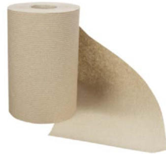
Universal Hand Towel Roll