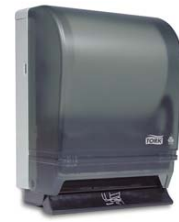
Hand Towel Roll Disp - Push Bar