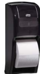
High-Capacity Bath Tissue Roll Disp. Twin - T26 Black 52159 555628A