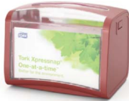
Red Tabletop 4 ct. 6236000 52170