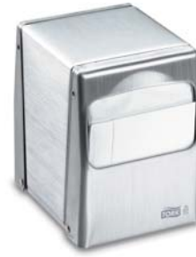
Napkin Table Dispenser - N9

Advanced Hand Towel Interfold - H2 3 panel White 2 ply 49590 21/144 ct. 101291