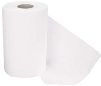
Universal Hand Towel Roll