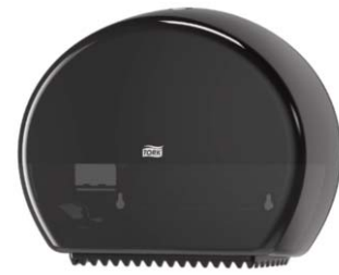
Mini Jumbo Roll Disp - T2 52172 1 ea. 555028A