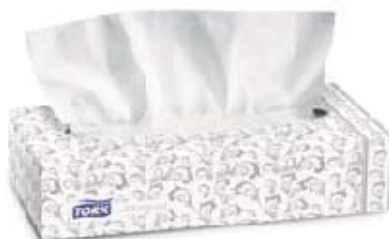
Facial Tissue - Flat Box White 2 ply 49696 30/100 ct.