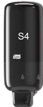
Manual Foam 52380 4 ct.