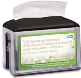
Black Tabletop Napkin 1 ea. 32XRT 52212