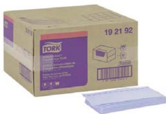
Blue Antimicrobial Tough Towel 49646 1/150 ct. 192192 13x24