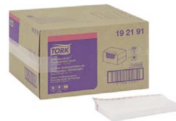
White Antimicrobial Tough Towel 49648 1/150 ct. 192191 13x24