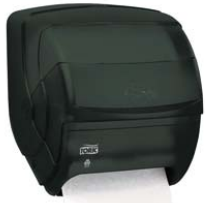
Hand Towel Roll Disp - Lever