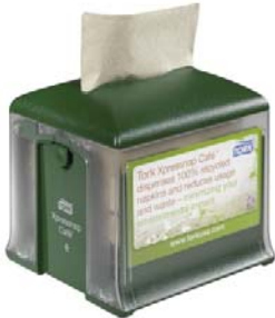
Green Tabletop Napkin 1 ea. 45XRT 52158