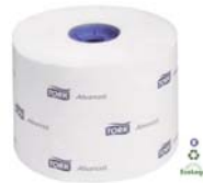
High-Capacity Double Bath Tissue Roll T26 49732 36/1M 110292A