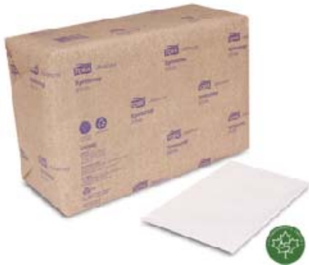
Advanced Xpressnap Dispenser Napkin, Interfold - N4 White 1 ply 49552 12/500 ct. DX900